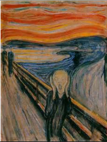
The Scream , 1893. oil and tempera on board, 35 ¾" x 29". National Gallery, Oslo.